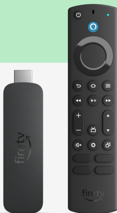
Figures apply to FireTV Stick 4K Max - 2nd Gen only, not including bundle accessories

Built to last. But when you're ready, you can trade-in or recycle your devices. Explore Amazon Second Chance.