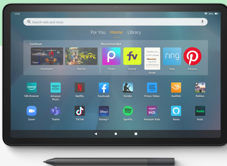
Figures apply to Fire Max 11 Tablet 64GB - 1st Gen only, not including bundle accessories

Built to last. But when you're ready, you can trade-in or recycle your devices. Explore Amazon Second Chance.